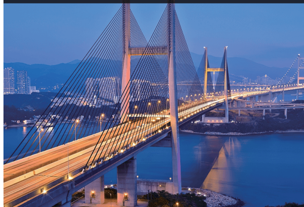
Wall Washer Light, Landscaping Light, Architecture lighting