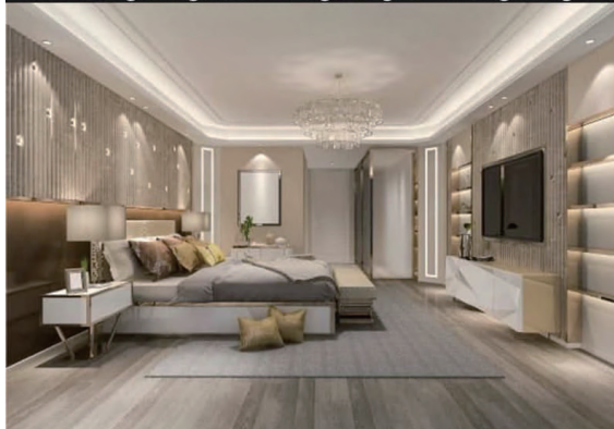
Candle lighting, Indoor lighting, Hotel lighting