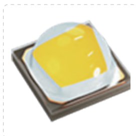
LED Cree XP-G4