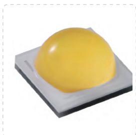
LED Cree XP-G4