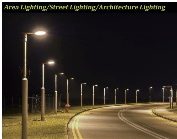
Area Lighting/Street Lighting/Architecture Lighting